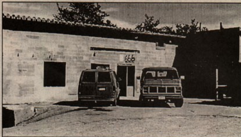
After D.E.A. agents raid a New York drug lab.

Most labs are shrouded in secrecy. They are usually located in aban-